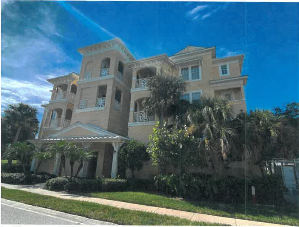
Figure 1: Typical 4-Story Roof Type (Metal) and Geometry (Hip)