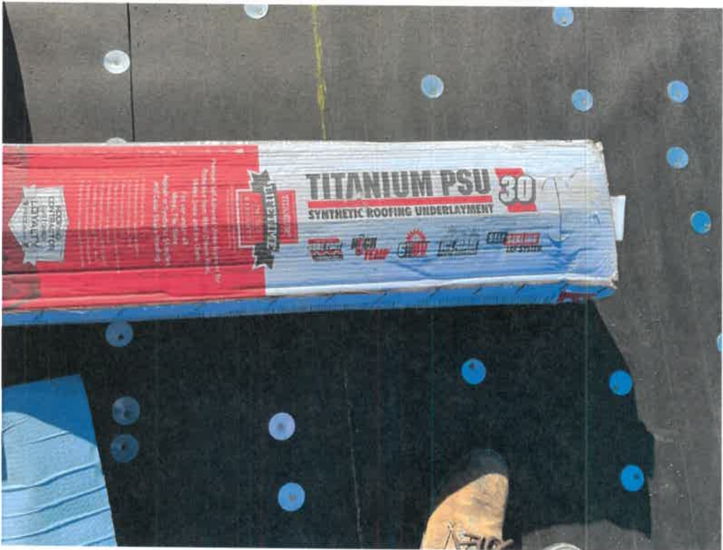
Figure 4 – Secondary Water Barrier at Sloped Section (Typical)