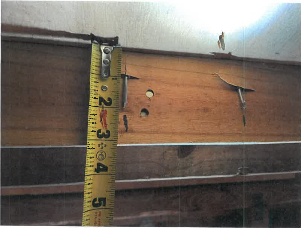
Figure 3 – Sheathing Fastener Size 8d Confirmed (Typical)