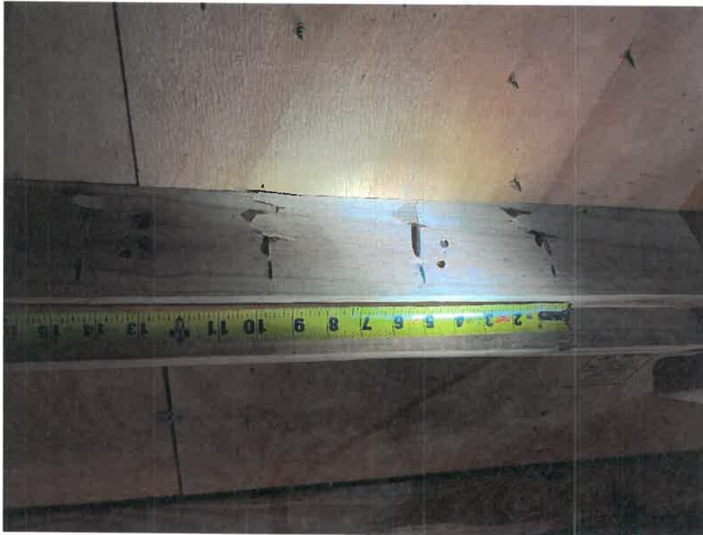
Figure 2 – Plywood Sheathing Nail Spacing (Typical)